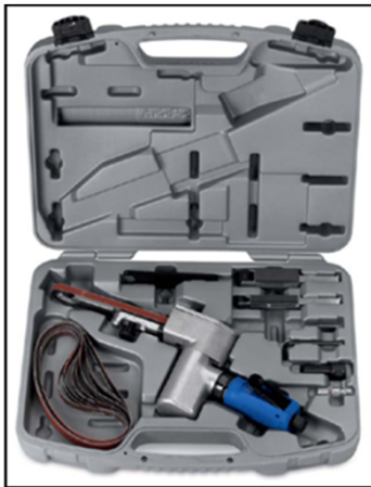
Blue-Point® AT615 Belt Sander Kit