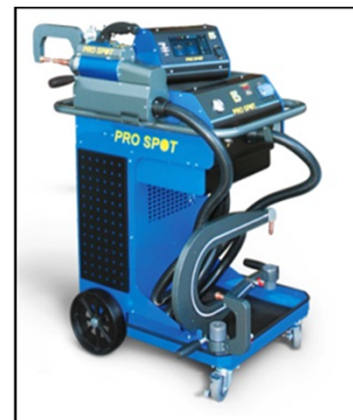
ProSpot i5 SMART Spot Welder