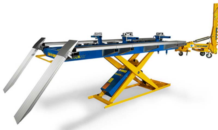
Car-O-Liner Benches and Measuring Systems