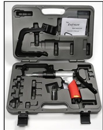
Blair Enforcer™ Spot Weld Drill Kit