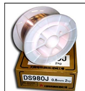
Bosch DS980J Solid Welding Wire