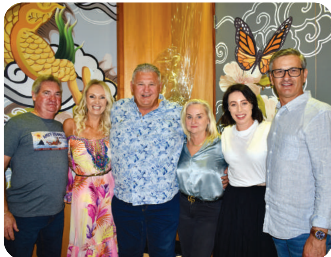
Above: Team members from Wallaby Crash Supplies.

The core business of Wallaby Crash Supplies is supplying Axalta Coatings to independent smash repairers, in addition to the Industrial, Aviation and Marine sectors.