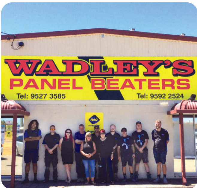
Above: Team members from Wadley's Panel Beaters.

"We love the Standox product - it's user friendly, efficient and very easy to apply. It's waterborne and environmentally friendly. We were the first shop in Western Australia to install the system. We also think the colour matching is excellent, and the technical support from Axalta is brilliant," Julie concluded.