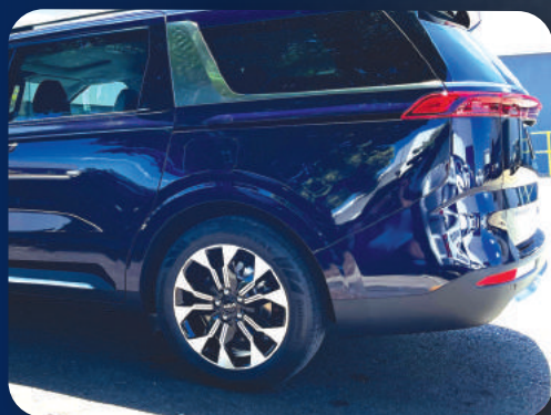
Above: WheelFix complete cosmetic wheel repairs.