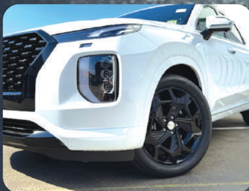
Above: Wheel colour changes are done in matte, satin and gloss finishes.