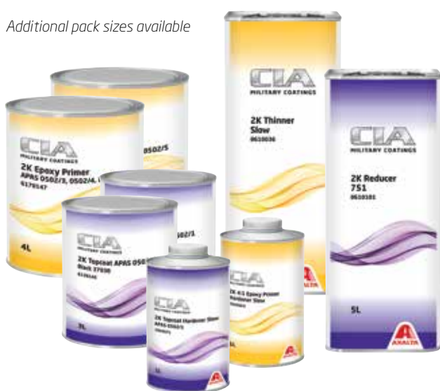
CIA Military Coating Products from Axalta