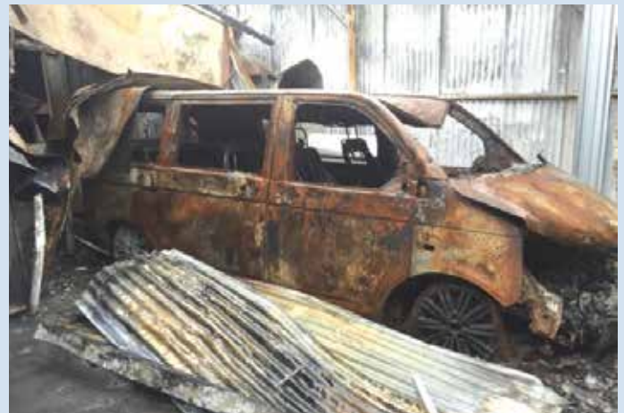
The shop was gutted by fire in 2016.