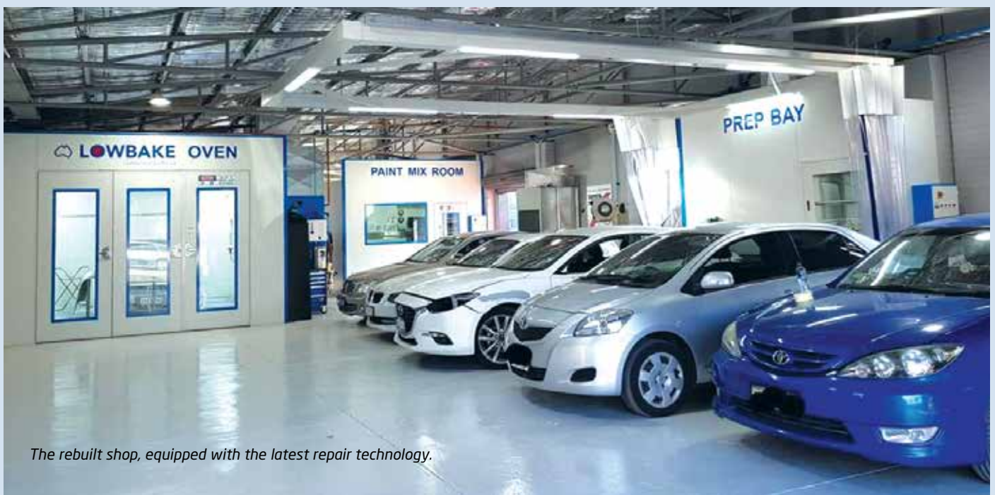
The rebuilt shop, equipped with the latest repair technology.