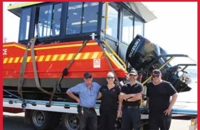
The team from Excel Marine hand over the fire boat, Engineering 15 to the RFS.